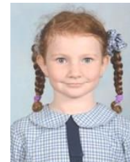
Isabella B 1/2F $215!